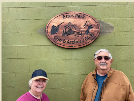
Club members installing the new indoor range wood sign