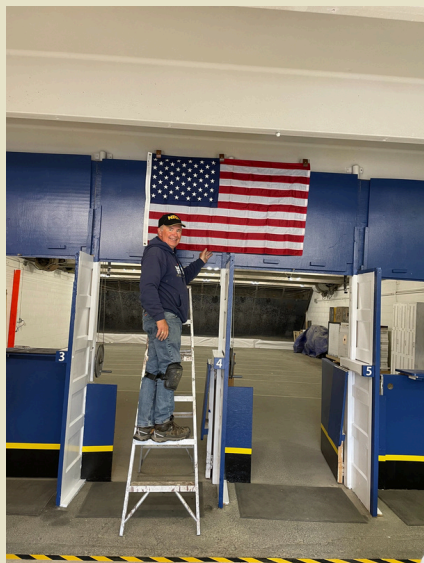
Hanging the flag