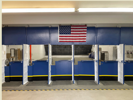
View as you enter our “refreshed” indoor range.